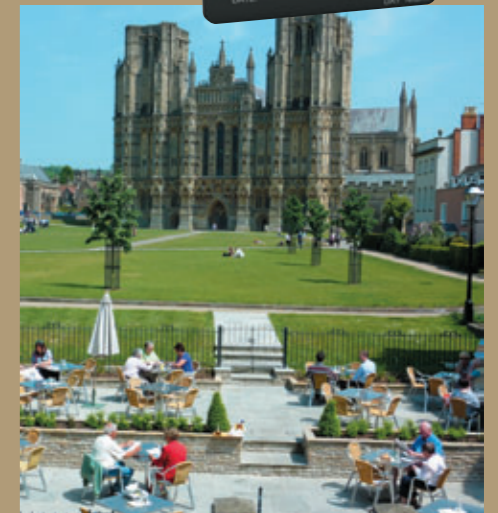
Diners enjoy a fantastic view from our front garden.