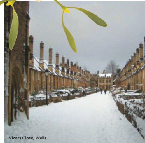
Vicars Close, Wells